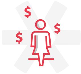
Anti Sex Trafficking