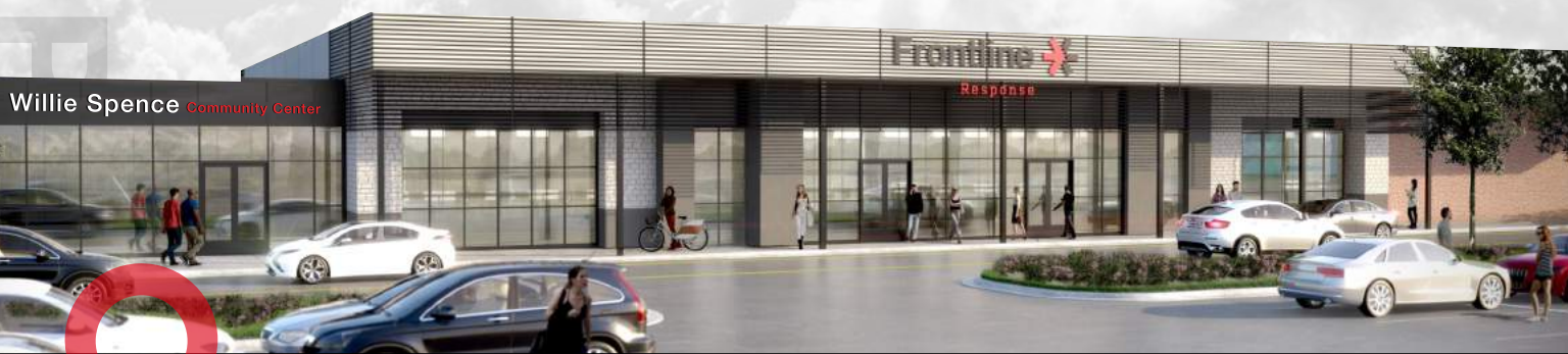
Willie Spence Community Center